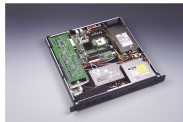
Supports one full-length 32-bit PCI expansion