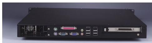
200W ATX PFC P/S & rear panel of motherboard version