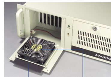
Easily replaceable cooling fan and filter One 85-CFM cooling fan