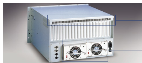
Rear side hole for heat-releasing Hot-swap redundant power supply