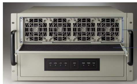
Four 53-CFM cooling fans Manually replaceable fan filter