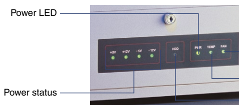
Power LED Power status HDD LED FAN LED TEMP LED FAN LED