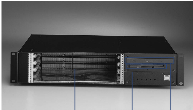
4-slot backplane with H.110 CT bus One slim FDD One slim CD-ROM