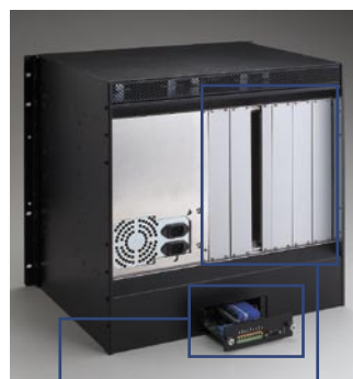
Intelligent alarm module (MIC-3921), detecting system power, fan speed and CPU temperature Supports IEEE 1101.11 rear I/O transition boards