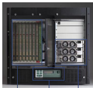
8-slot backplane with H.110 CT Bus LCM for system status (MIC-3921) 560 W ATX 2+1 redundant power supply