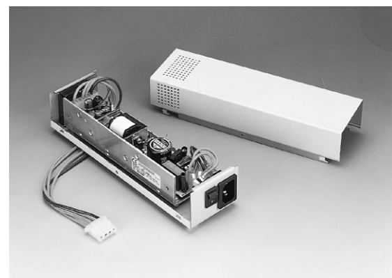
PS-55A Power Supply